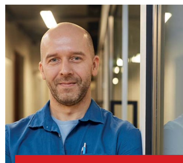
"New technical systems must be easy to implement in existing infrastructures and also allow easy, low-cost maintenance."