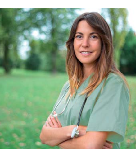
Gain time with the optimal sample quality Reduce time and personnel and material costs with the S-Monovette®