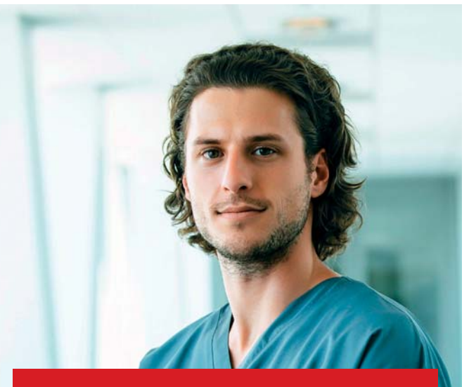
"When specimens remain on the ward after collection until they are picked up or in-house transport is organised, we lose valuable time and the specimen material gets older."

"Rapid, valid information is key for our work in the emergency department. Fast, reliable transport of specimens leads to fast results and thus to faster treatment for my patients."