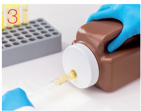
The large-volume NFT urine container also ensures sample collection remains hygienic thanks to the enclosed collection function.