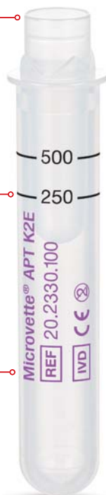
Microvette® APT 500

Time-saving analysis – direct and hygienic out of the primary tube. Newly developed Membrane cap guarantees at the same time safe transport and shipping of the sample.