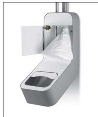
Filter bag for cleaning