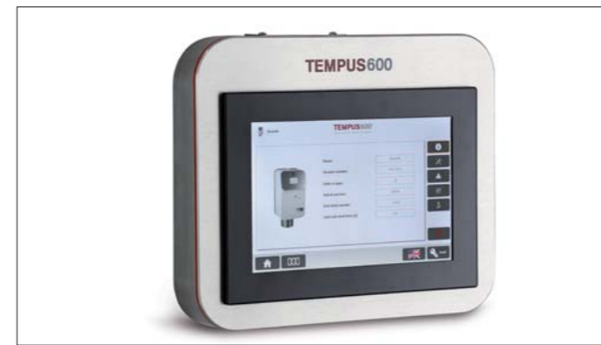
Intuitive user interface