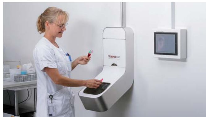
Samples arrive in the Receiving Tray where they are retrieved.