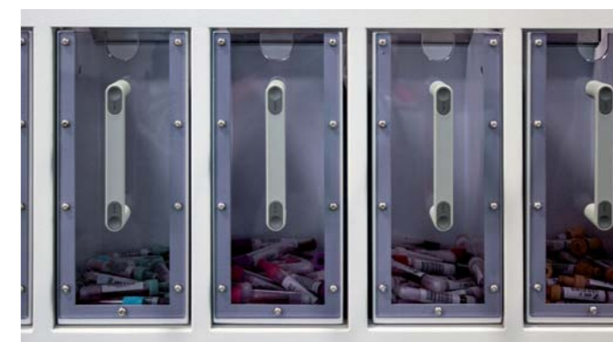
Sorting into target boxes

Tempus600® combined with Bulk-to-Bulk Sorter HCTS2000 MK 2 simplifies sample reception workflow. The sorter registers and sorts closed bulk sample tubes into different target compartments according to the bar code (sample preparation) or test request specified by the LIS. With an optional camera in use, the system can perform a plausibility check to identify and separate error samples. HCTS2000 MK 2 helps to optimize the workflow at sample entry of biochemistry or hematology labs, thereby reducing the turn-around-time (TAT) of samples.