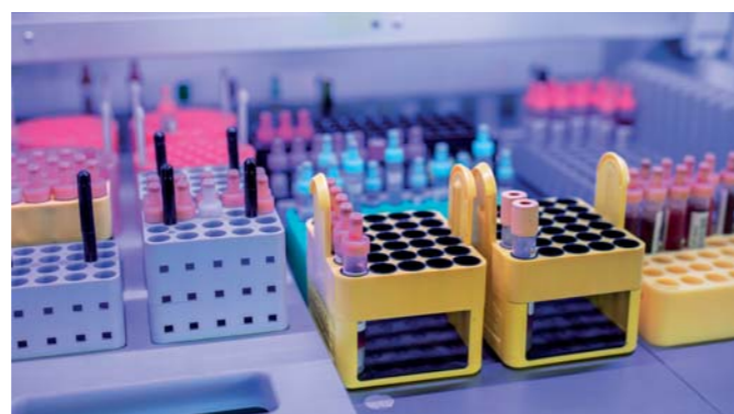
Automatic Output in Racks