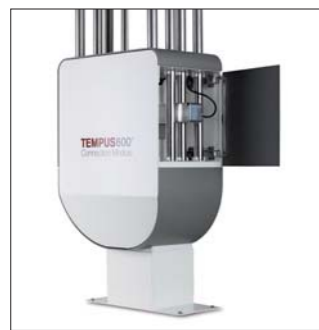
Connection Module with a brake