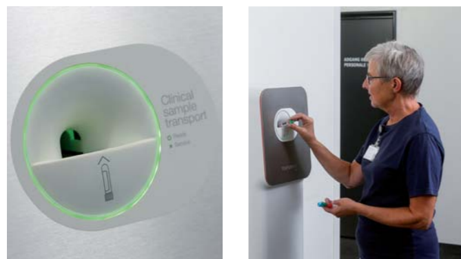
Sample tubes are placed in the insertion point of the Vita.

The slim and minimalistic design ensures the sending station fits into most locations, occupying very little space.