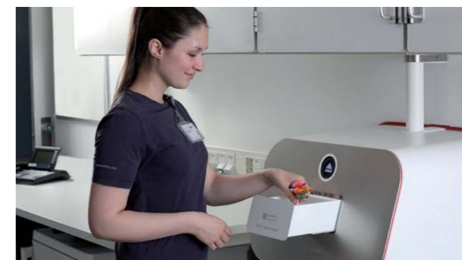
Multiple inlet for up to 25 samples at a time.