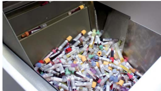
A: Sorting module

Necto comes standard with one sending module. One, two or three extra sending modules can be purchased.