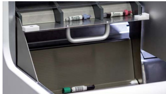
B: Urgent module