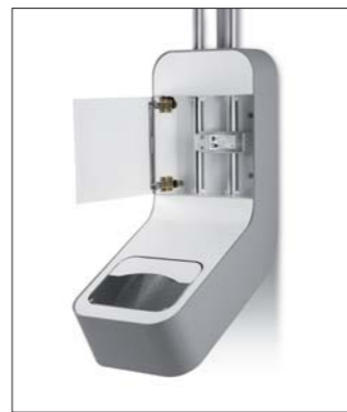
Receiving Tray with a brake