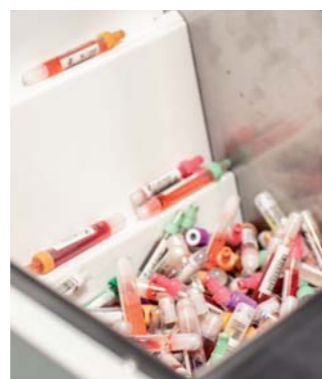
Loading in bulk