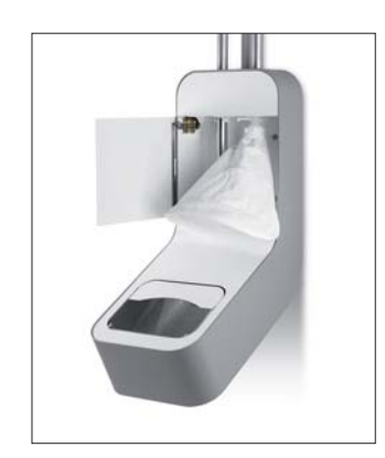
Filter bag for cleaning