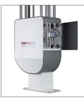
Connection Module with a brake