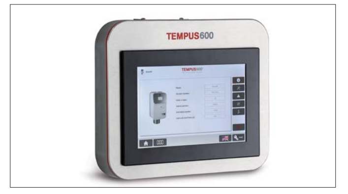
Intuitive user interface