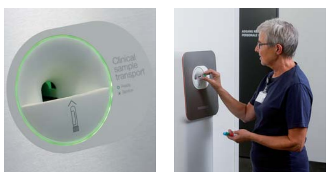
Sample tubes are placed in the insertion point of the Vita.

The slim and minimalistic design ensures the sending station fits into most locations, occupying very little space.