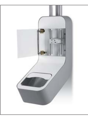
Receiving Tray with a brake