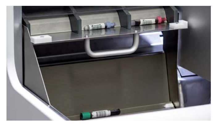
B: Urgent module