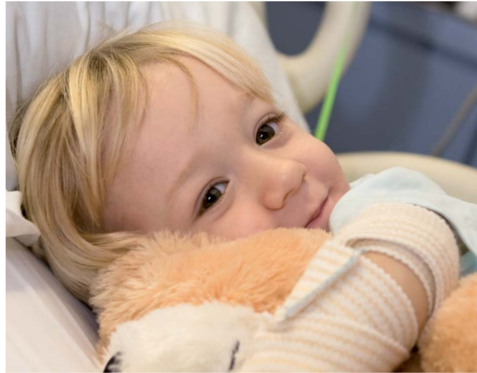
Infants & Toddlers