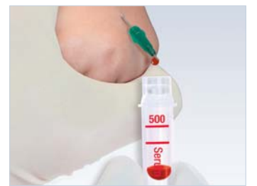
Microvette® with Micro-Needle